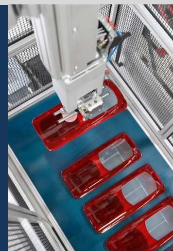
VIGNAL LC12 LED tail light