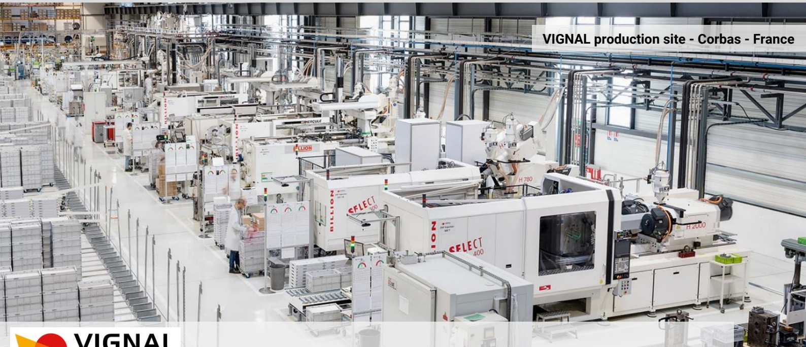
VIGNAL production site - Corbas - France