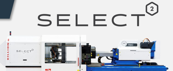
From 175 to 400 Tons, for every production need!